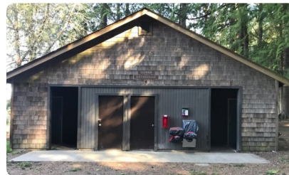
Main Camp Bathrooms & Showerhouses