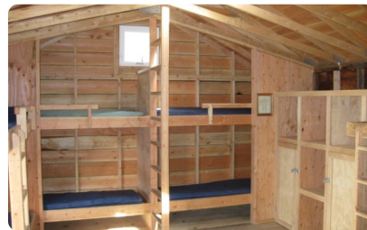
Typical Main Camp Cabin Interior

Main Camp cabins are more rustic, located on the beach or nestled among the trees. Fully enclosed, these house up to 10