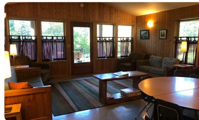
Dederer Center Interior