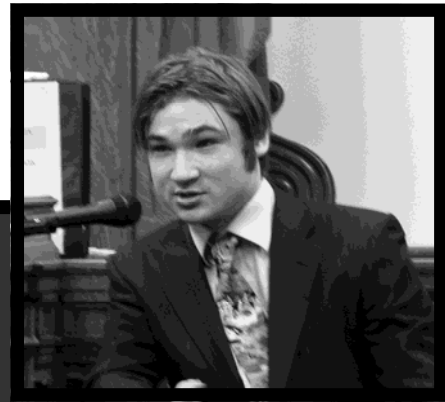
Mock Trial students during the Pierce County & King County Mock Trial District competitions.