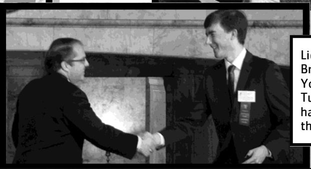
Lieutenant Governor Brad Owen shakes Youth Governor Tucker Cholvin's hand after signing the Proclamation.