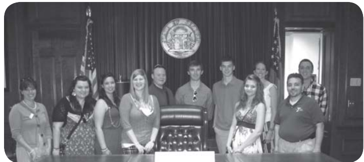
The 2011 CONA delegation in the Georgia State Governor's Office